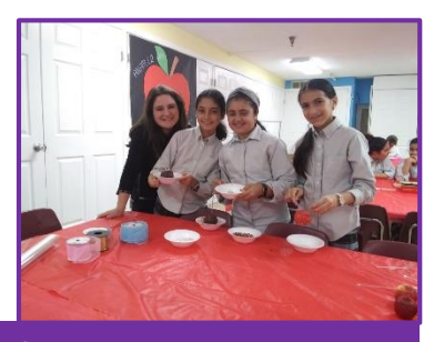
Candy Apples for Rosh Hashanah!